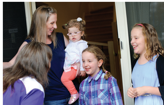
Vision Australia offers specialist support and advice for the whole family.