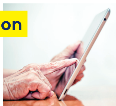
Technology helps elderly people stay connected with their loved ones.

Thanks to the kindness of people like you, Vision Australia is helping people who are blind or have low vision benefit from technology.